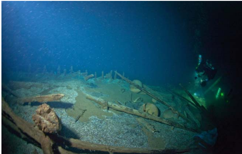
Byzantium shipwreck 2/2 XIII century

In 2004, in conformity with the requirements of the International Convention for the Protection of Underwater Heritage, the Institute of Archaeology of NUAS established the Department of Underwater Heritage of Ukraine - a specialized state-owned enterprise, whose main task is the development of underwater archeology in Ukraine. Scientists of the Department created the first register of underwater cultural heritage of Ukraine, and the map "Monuments of underwater cultural heritage of Ukraine." All known and open objects were put on the state scientific register. All objects of archeology and history in exclusive /marine /economical zone, territorial sea and internal waters of Ukraine were recorded for the first time on the Register and on the map. 2,514 objects were registered. The presence of a gray-hydrogen layer in the Black Sea gives the chance for the discovery of well-preserved monuments even from antiquity in its depths.